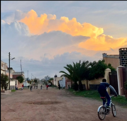
Asmara, Eritrea, 2024

For nearly forty years of intermittent conflict, from the Eritrean war of independence to the Eritrea-Ethiopia border war. Asmara, the capital of Eritrea, was never in ruins. The city operated as normal, serving the military and